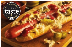
BEEF HOT DOG XL | 18CM | 80G XXL | 26CM | 110G FOOTLONG | 30CM | 155G