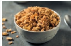
CRISPY FRIED ONIONS