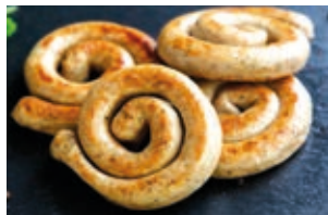
BRATWURST SPIRAL XL | 10CM | 120G