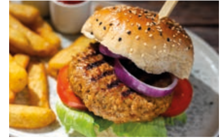
FRIKADELLEN PORK BURGER