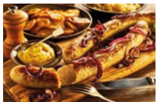
BRATWURST CLASSIC XXL | 25CM | 150G FOOTLONG | 30CM | 200G