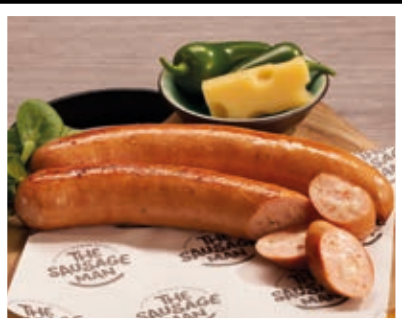
JALAPENO AND CHEESE FRANKFURTER XXL 25CM | 150G (PACK OF 10)