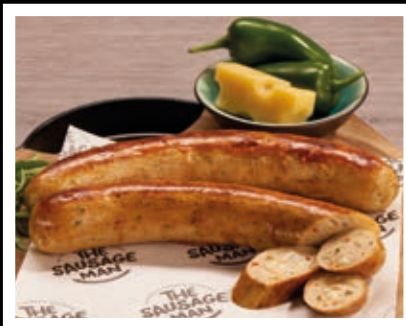
JALAPENO AND CHEESE BRATWURST XXL 25CM | 150G (PACK OF 10)