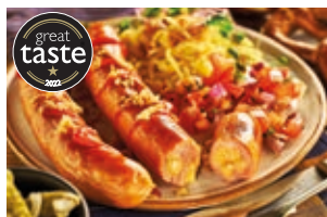
CHEESE FRANKFURTER L | 16CM | 100G XXL | 25CM | 150G