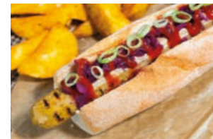
VEGAN BRATWURST XL | 20CM | 100G