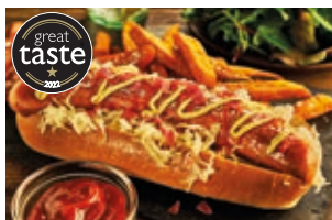
KRAKAUER BACON FRANKFURTER XXL | 25CM | 150G FOOTLONG | 30CM | 200G