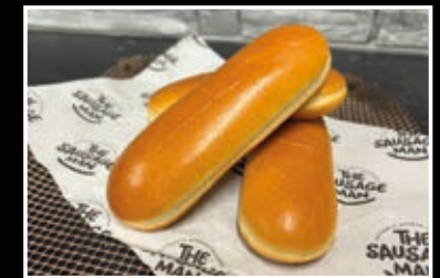
ST PIERRE HOT DOG ROLL