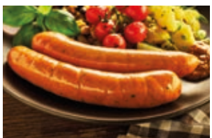
PORK JUMBO BOCKWURST XL | 18CM | 120G