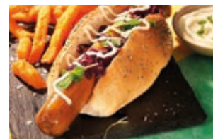
VEGAN HOT DOG XL | 20CM | 100G