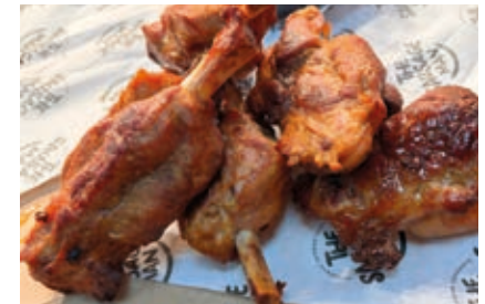
MINI PORK KNUCKLE