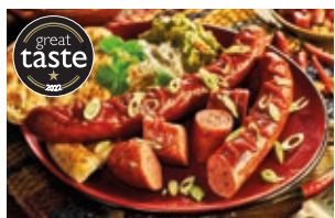
CHILLI BEEF FRANKFURTER GIANT | 28CM | 160G