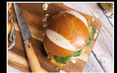
PRETZEL BURGER BUN