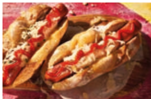
PORK HOT DOG XL | 18CM | 85G XXL | 26CM | 115G FOOTLONG | 30CM | 155G