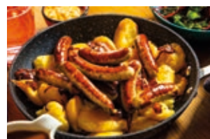
BRATWURST NURNBERGER MINI | 8CM | 20G