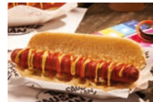
HALAL BEEF HOT DOG XL | 20CM | 110G