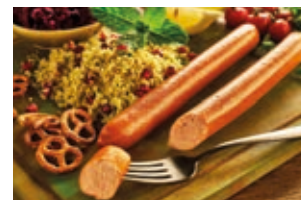
HALAL TURKEY HOT DOG XL | 20CM | 110G