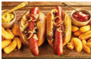
VIENNA BEEF FRANKFURTER XL | 20CM | 100G