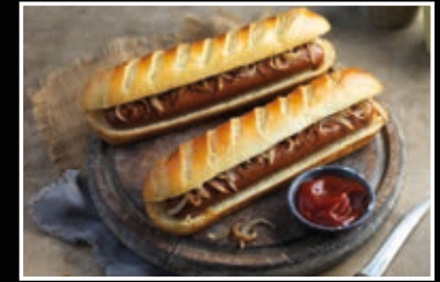
ST PIERRE BRIOCHE BAGUETTE